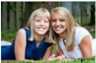
9/22/09 - Abernathy Family